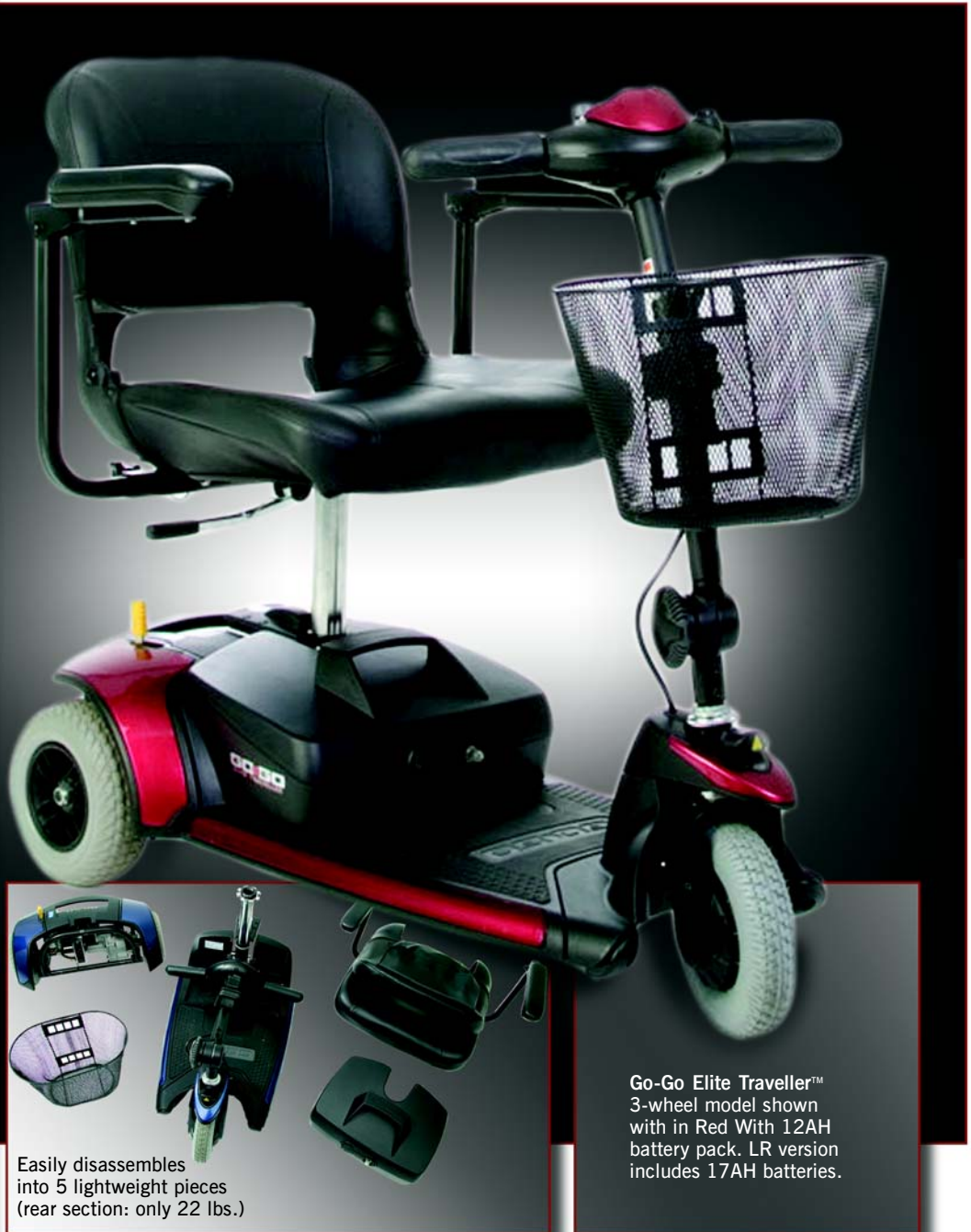
Go-Go Elite Traveller™ 3-wheel model shown with in Red With 12AH battery pack. LR version includes 17AH batteries.