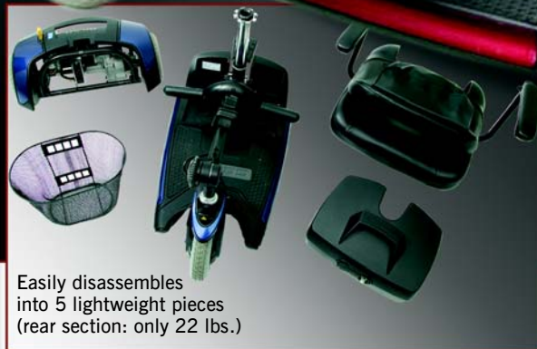
Easily disassembles into 5 lightweight pieces (rear section: only 22 lbs.)