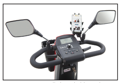
Rear view mirrors, cell phone holder and built-in speaker system with Bluetooth® & USB connectivity.