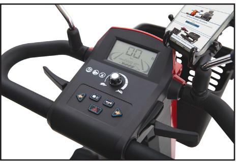
Integrated LCD console display monitors speed, odometer, fault codes & battery life.