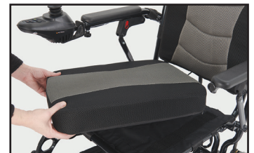
Removable Padded Seat