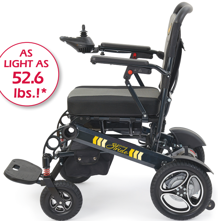
Portable & high-performing with an aluminum frame!