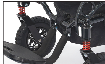
Comfort Spring Suspension for a Smooth Ride