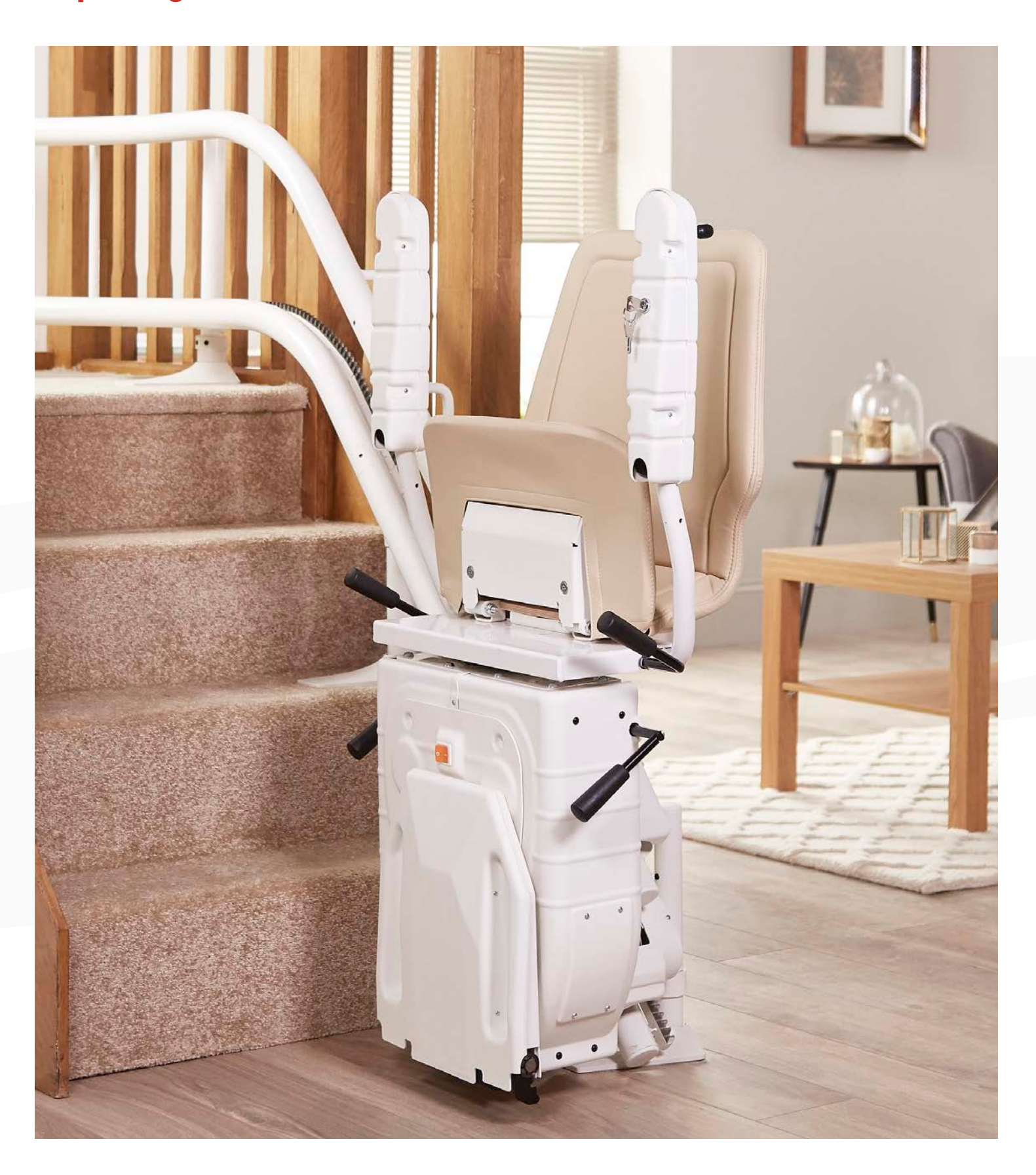
Step 1: Begin with the folded chair